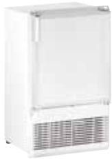
WHITE SOLID (FLANGE TO CABINET)